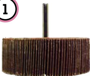
SPINDLE MOUNTED FLAP WHEELS

For general purpose cleaning and deburring applications.