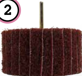
INTERLEAVED SPINDLE MOUNTED FLAP WHEELS

For light deburring and pre-finish cleaning applications.