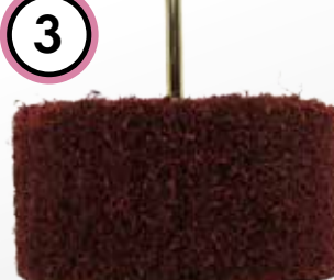
NON-WOVEN SPINDLE MOUNTED FLAP WHEELS

For final finish cleaning and polishing applications.